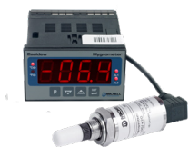
Easidew Online Dew-Point Hygrometer