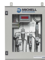
ES20 Compact Sampling System

Michell Instruments adopts a continuous development programme which sometimes necessitates specification changes without notice. Issue no: MDM300_97156_V9.7_EN_0223