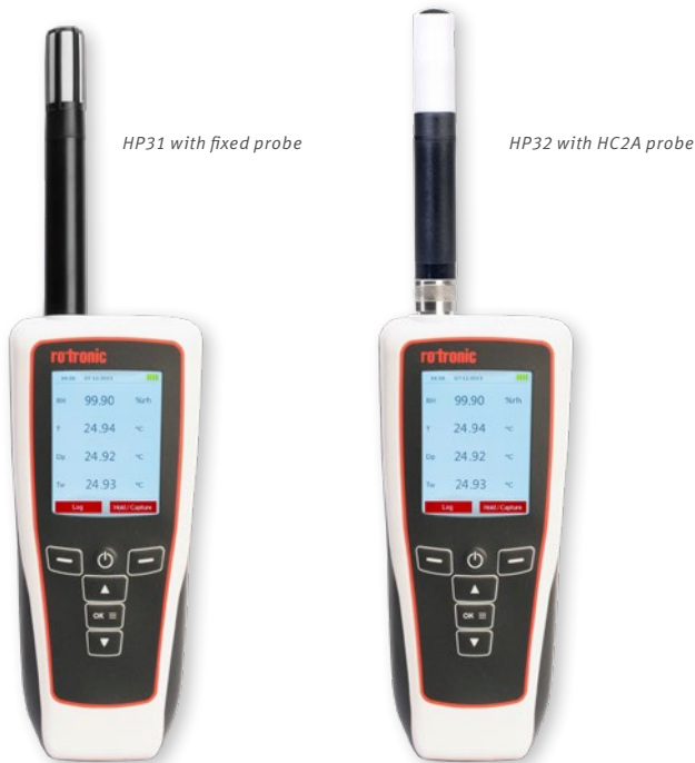
HP31 with fixed probe